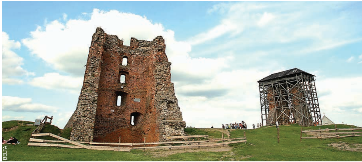
Reconstruction of Novogrudok Castle at full speed

Well-loved Novogrudok Castle undergoes restoration