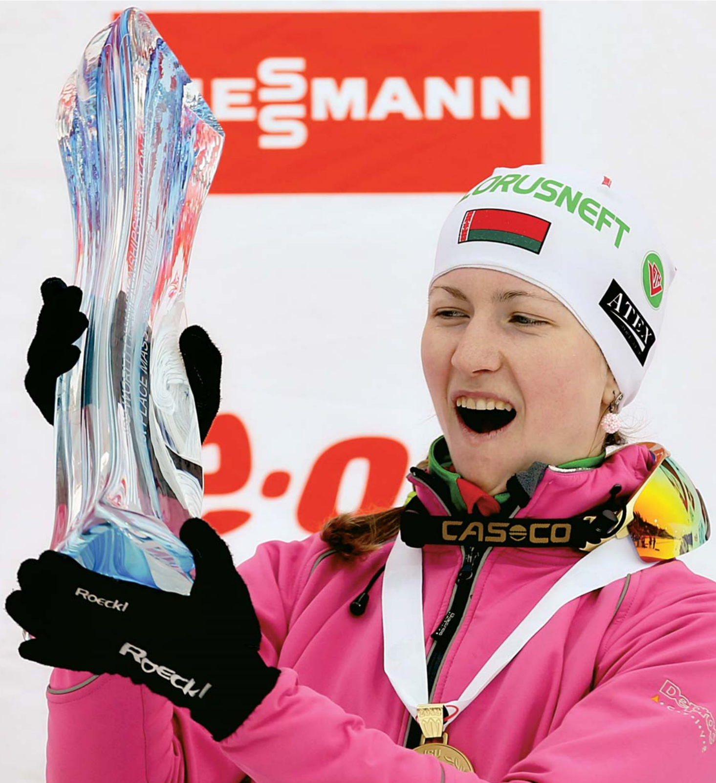
Darya Domracheva is pleased to receive this prize

Victoria Azarenko wins Premier series tennis tournament in Doha for second time, beating Serena Williams in finals Page 11