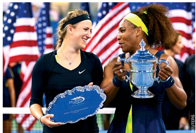
Victoria Azarenko (L) and Serena Williams pose with their trophies