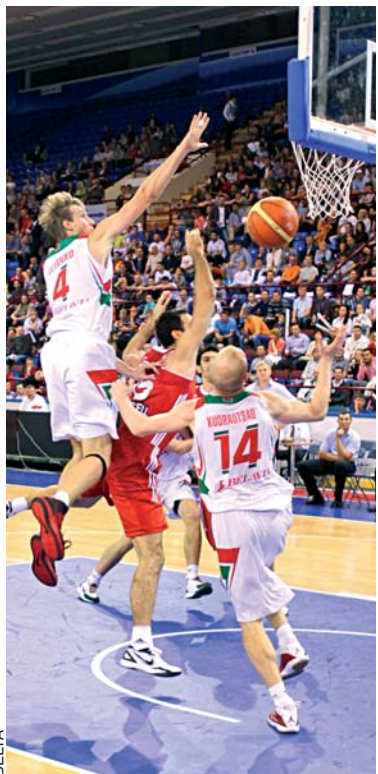
During Belarus-Turkey match